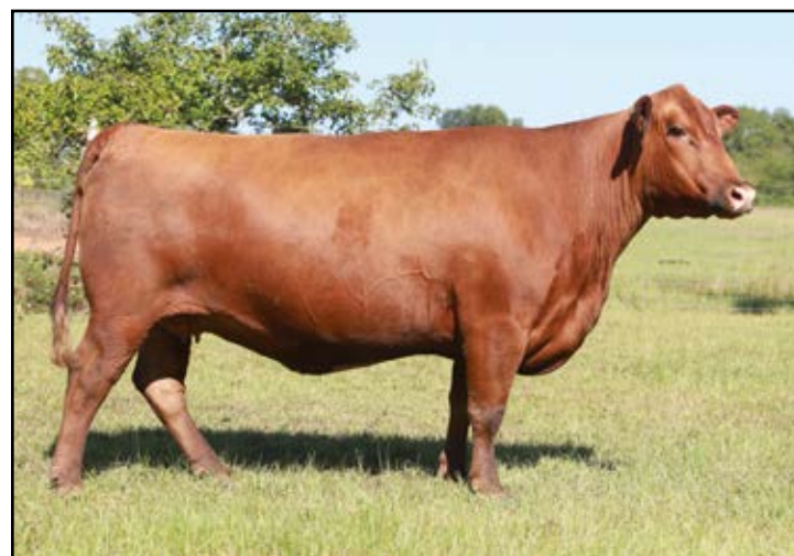
Lot 4 - LSF SRR Dina C5131 F8092