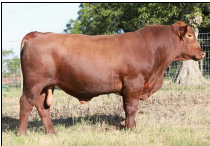
Lot 90 - JYJ Energize K6373