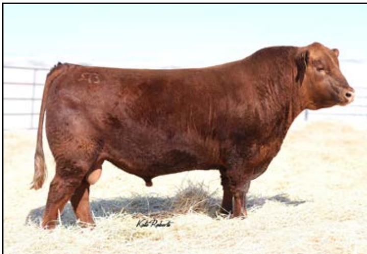
- Brown BLW Fantastic C5959 - $115,000 Sire of Lot 3