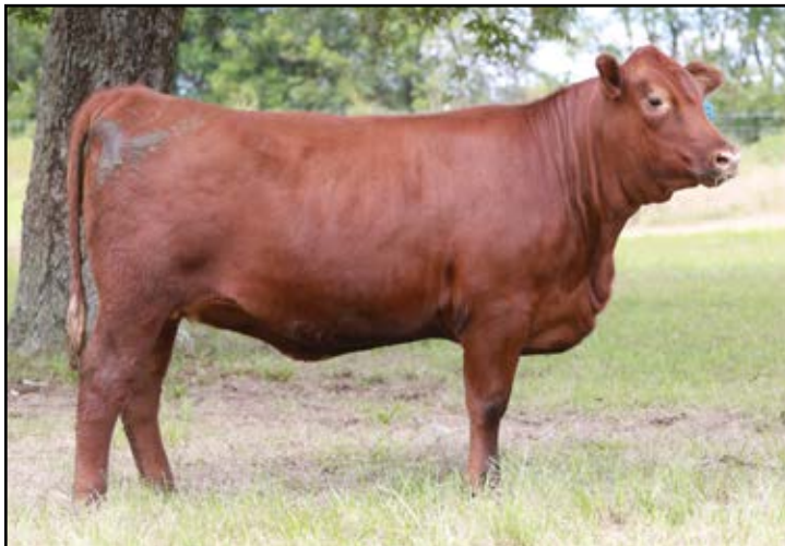
Lot 22 - CDCR K06