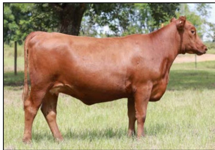
Lot 8 - JYJ Ms President K521