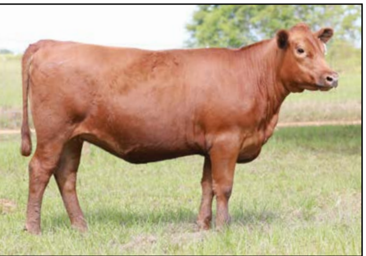
Lot 19B - JYJ Ms Cornerstone K569