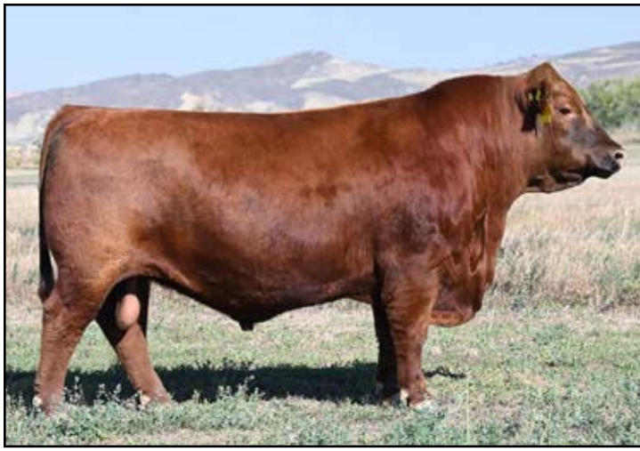
- LSF SRR President 8177F - $100,000 Sire of Lots: 24-27