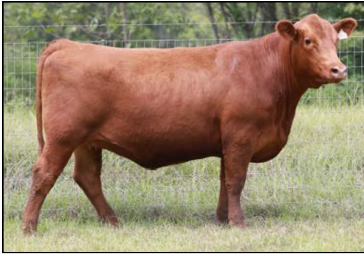
Lot 12 - PVCC 5959-028F Omega 009K