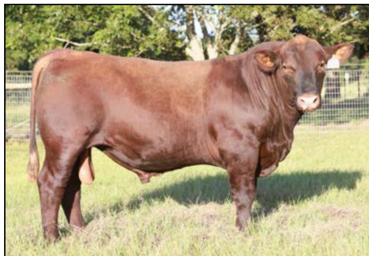
Lot 92 - JYJ FRMC Uno K6366

• Combining Stockmarket and Oracle in the same pedigree is a recipe to increase pounds, length of body, muscling and calf value. • Dam sells as Lot 34.