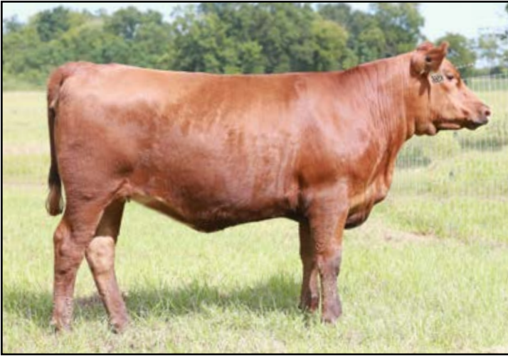
Lot 20A - JYJ Ms Cornerstone K566