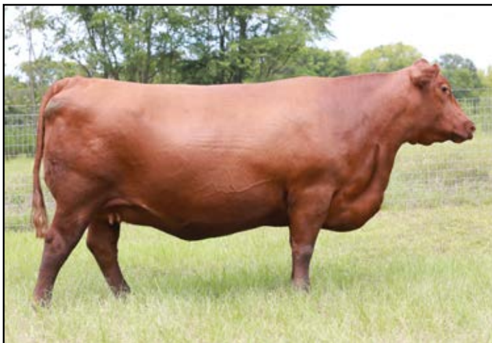
Lot 28 - JYJ Ms Independence E198 - Highly Prolific Donor Dam -