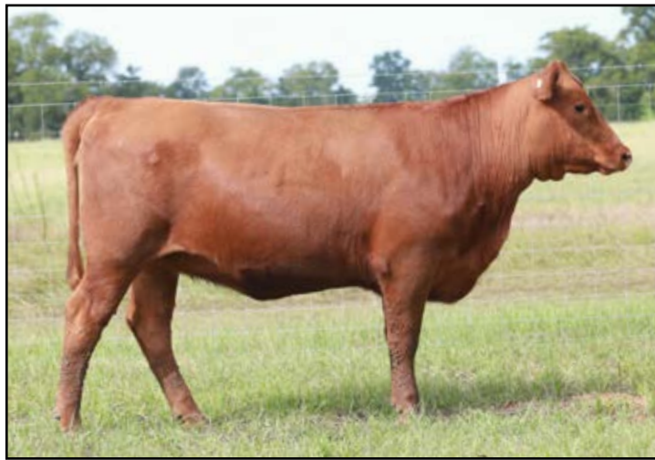
Lot 19A - JYJ Ms Cornerstone K567