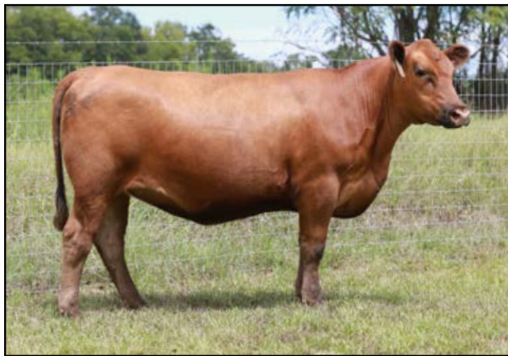
Lot 72 - JYJ Ms Ranchmaster K528