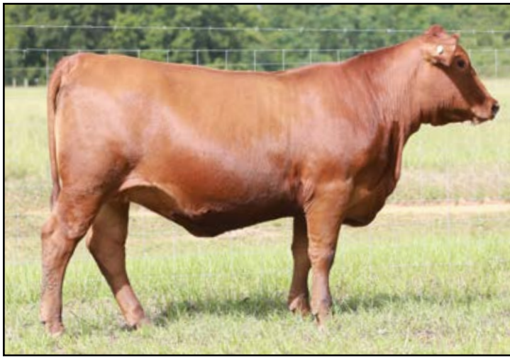
Lot 21A - JYJ Ms Brunswick K561