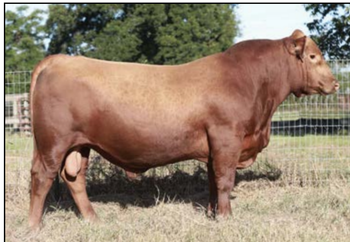
Lot 91 - JYJ Patriot K6403

• If you want to develop reputation feeder calves, that feeders recognize for their superior gain, conversion and carcass merit, Lot 91 is an excellent candidate. Check out his superior EPD ranks for weaning, yearling, ADG, carcass weight, marbling and REA.