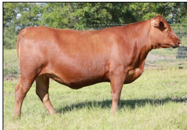
Lot 9 - JYJ Ms Ranchmaster K548