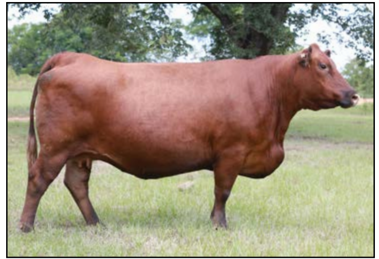
Lot 29 - JYJ Ms Trilogy C129