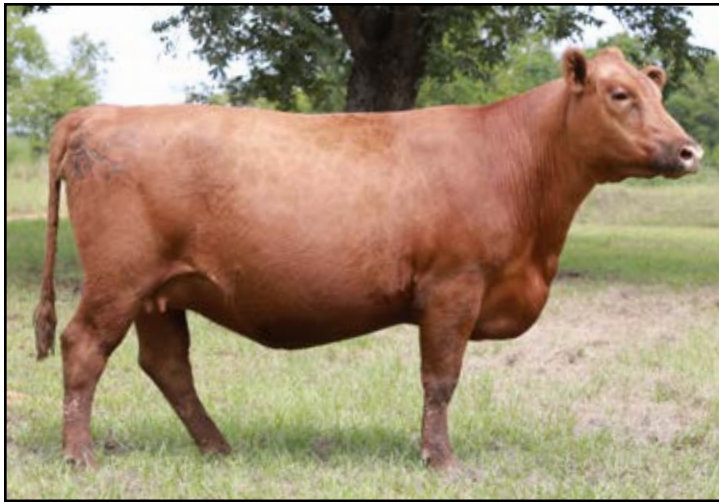
Lot 27 - JYJ Ms President J458