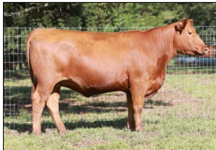
Lot 10 - JYJ Ms Patriot K524