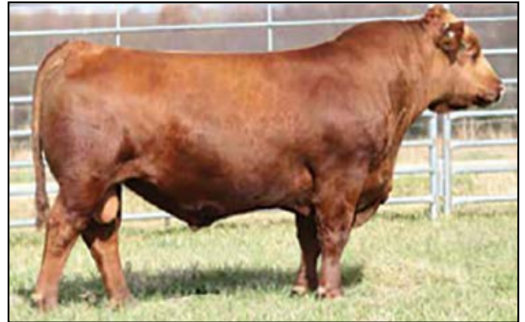
- Brown PRA Patriot G6291 - Sire of Lot: 54, Service Sire of Lot 56

• Powerful Patriot daughter that predicts to improve feed efficiency, REA, gain and pay-weight. Her dam is a donor for 3K Land & Cattle in Justin, TX and has amazing progeny ratios of: 111 weaning, 109 yearling, 108 IMF and 108 REA.