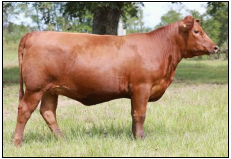
Lot 21B - JYJ Ms Brunswick K574