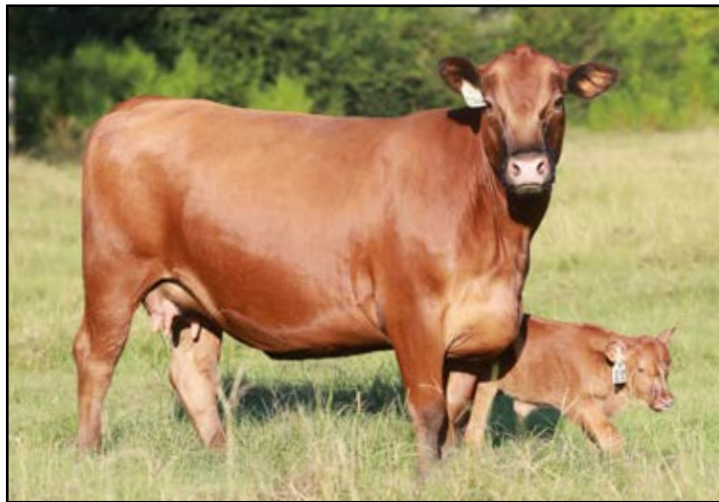
Lot 2 - JYJ Ms Brunswick H413 Get 2 A.I. Sired Females with 1 Bid!