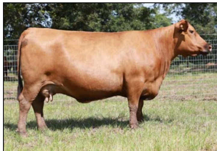
Lot 5 - JYJ Ms Trilogy D148