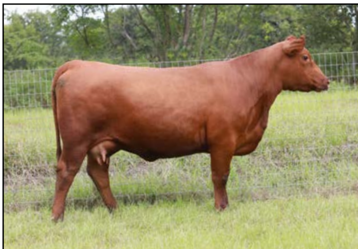
Lot 51 - CDCR J-02