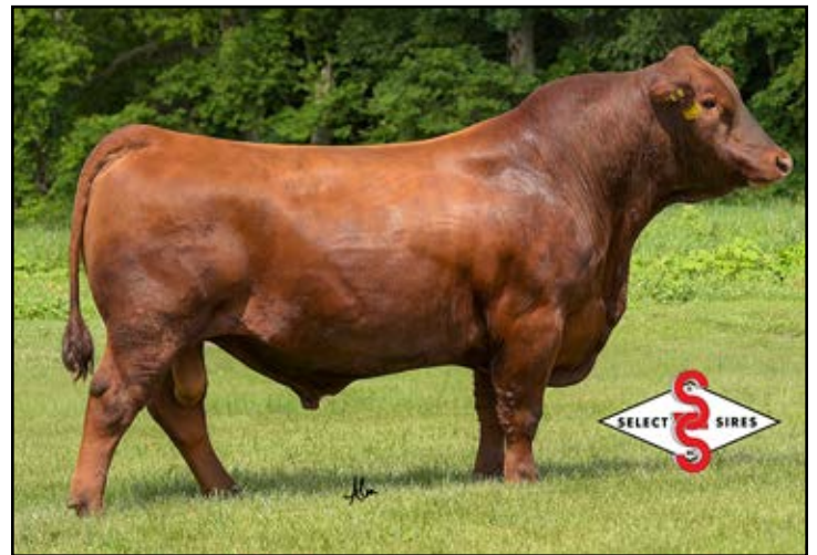
- HXC Grindstone 9908G - Sire of Lots 16 & 17