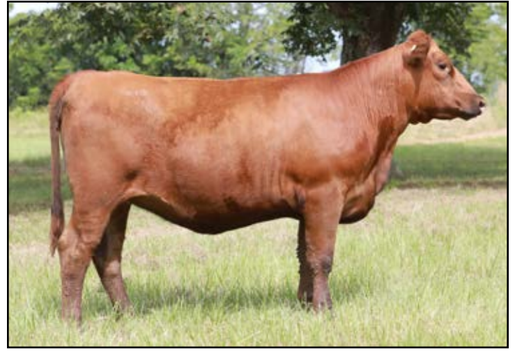
Lot 20B - JYJ Ms Cornerstone K575