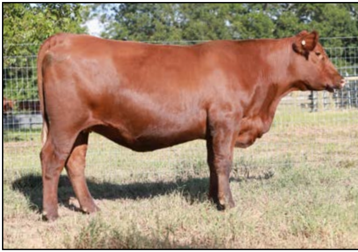
Lot 11 - JYJ Ms Merlin K519