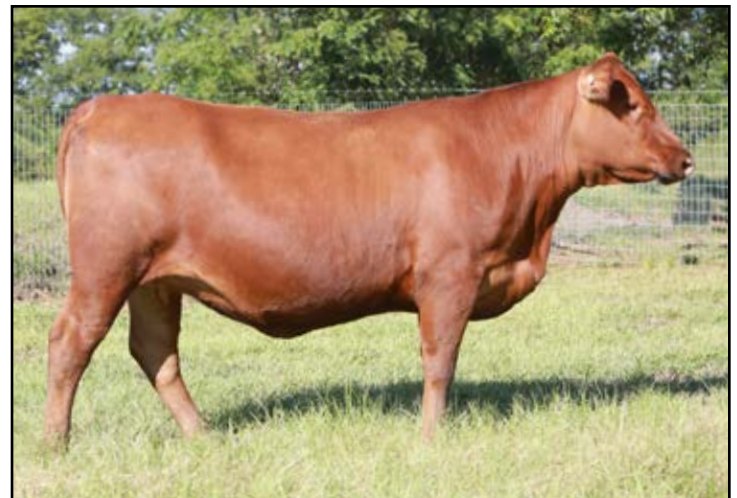
Lot 38 - JYJ Ms Brunswick K549

• Bred AI to LSF SRR President G6291, Due 1/11/24, Fetal Sex - Heifer