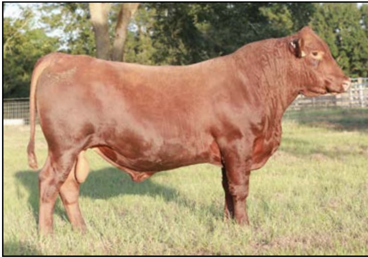
Lot 95 - JYJ Grindstone K6410