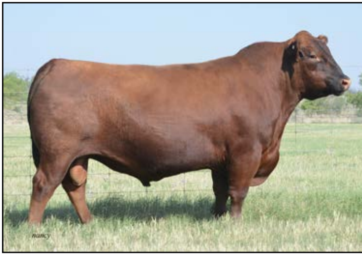
- Wedel Ranchmaster 9052G - $80,000 Sire of Lot 18