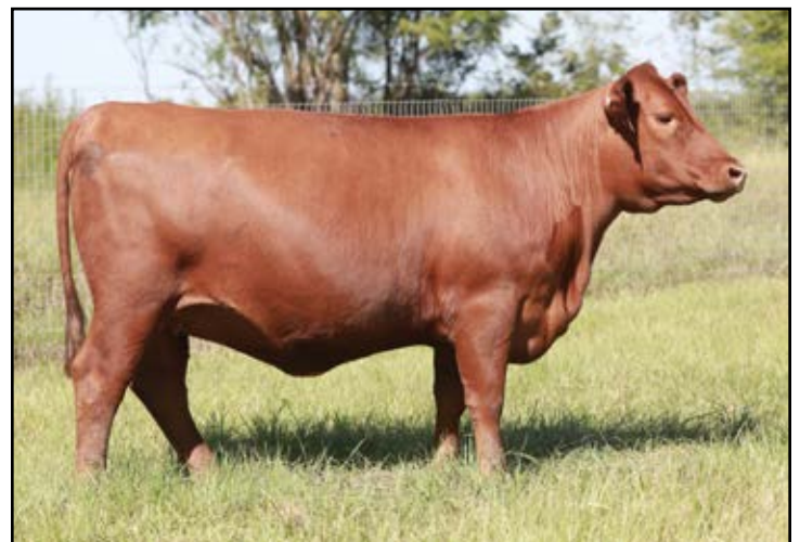
Lot 17 - JYJ Ms Grindstone K544