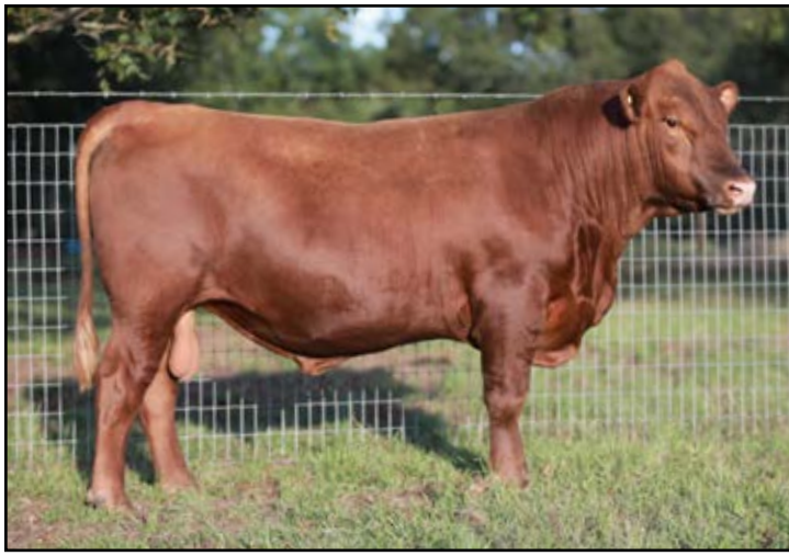
Lot 94 - JYJ Believe K6395