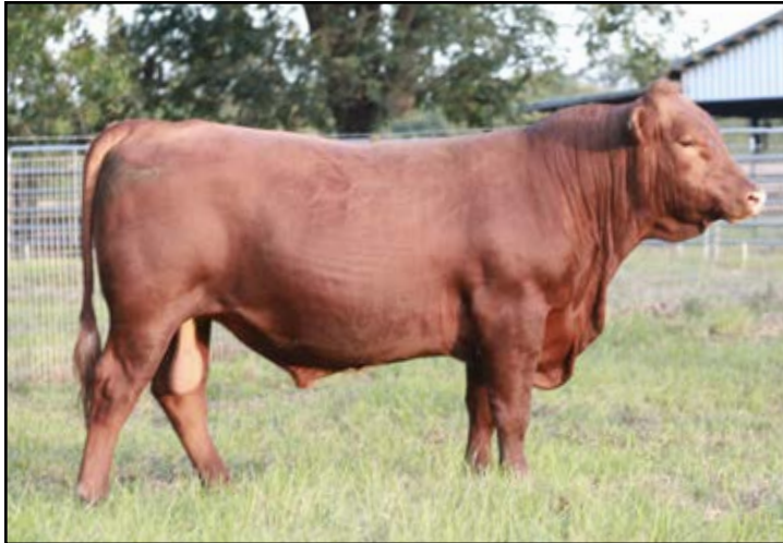
Lot 87 - JYJ President K6380