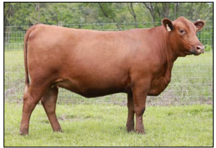
Lot 44 - PVC 042G Valentina 055K