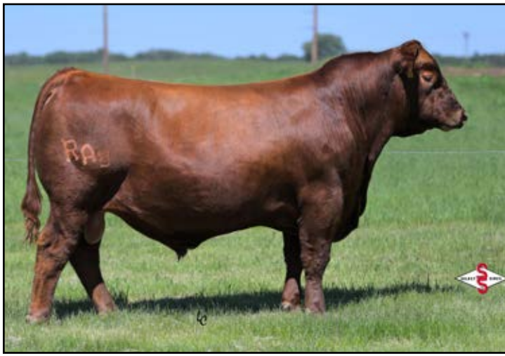
- Bieber Jumpstart B137 - $185,000 Sire of Lot 1 heifer calf