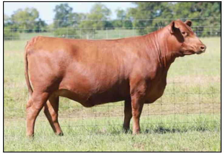
Lot 15 - PVC G1416-061F Omega 130K