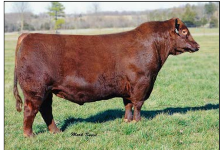
- Brown JYJ Redemption Y1334 - Maternal Brother to Lot 32 and High use Red Angus Sire for 4 consecutive years.